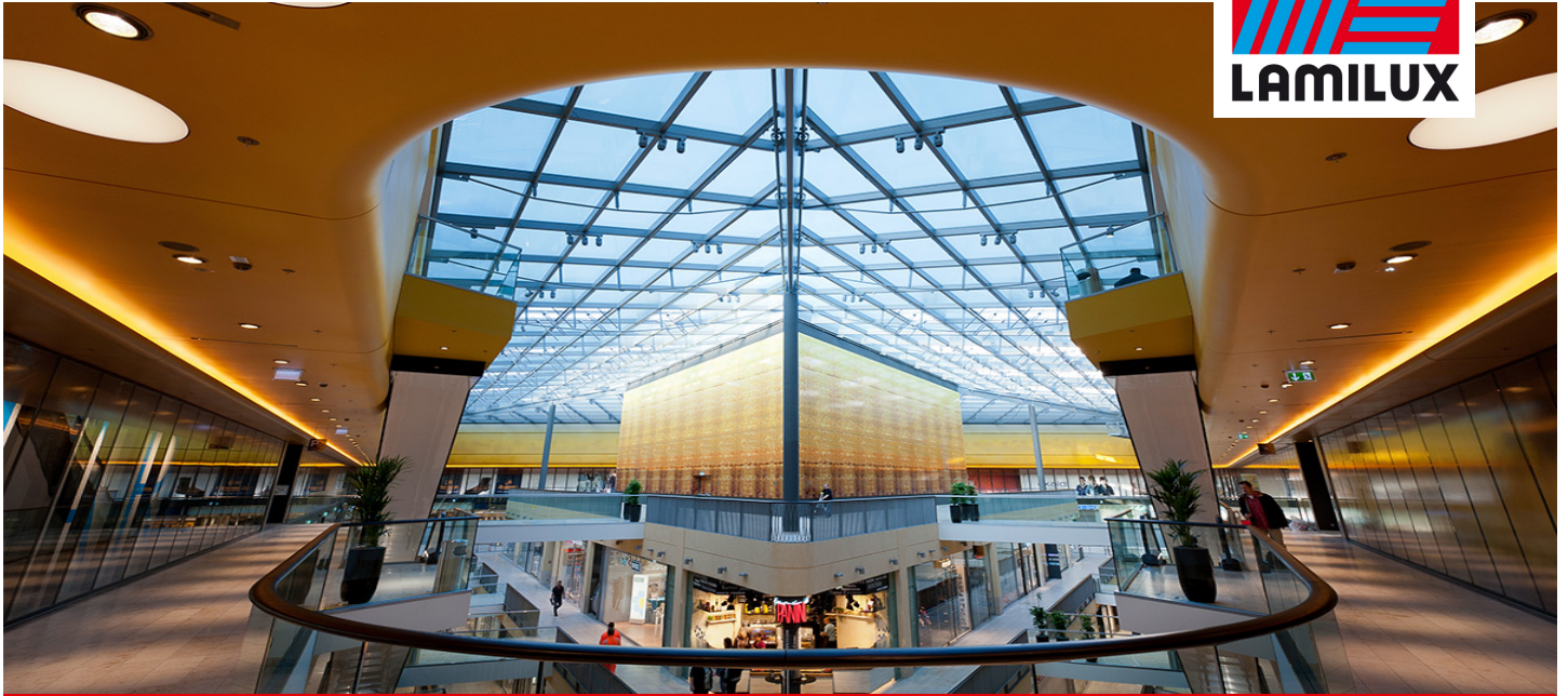
Shopping mall Thier-Galerie, Dortmund