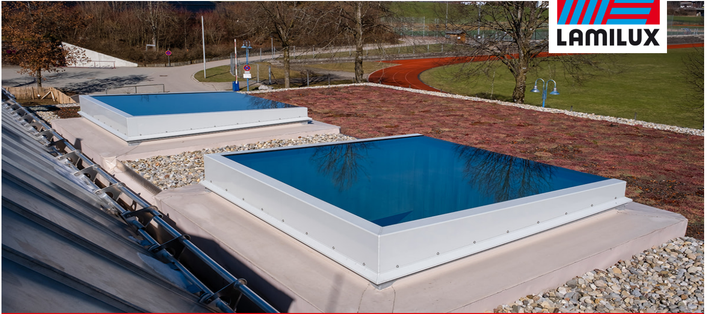
Municipal Crèche, Waltenhofen (Germany)