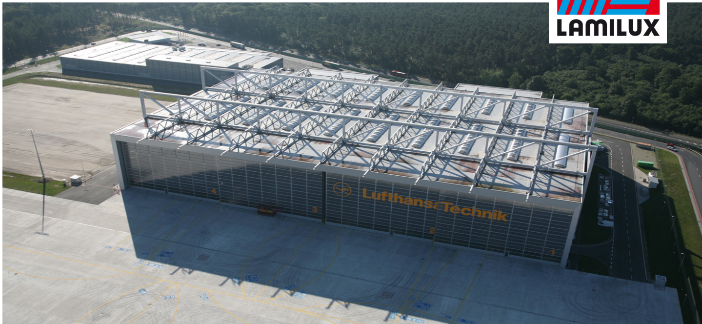
A380 Assembly Hangar