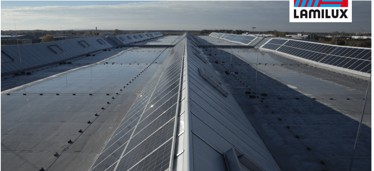
Logistics Center, Hoppegarten