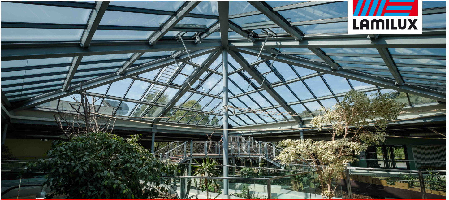
Zoo, Neuwied (Germany)