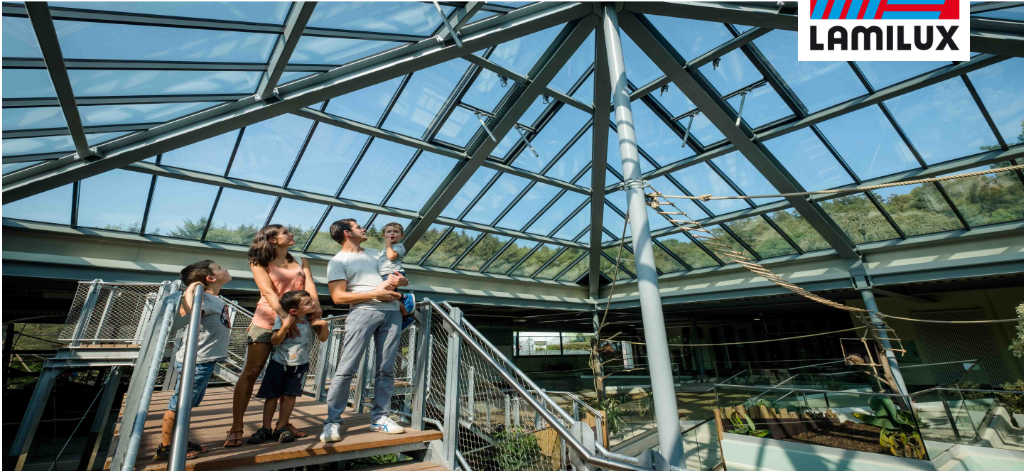
Zoo, Neuwied (Germany)