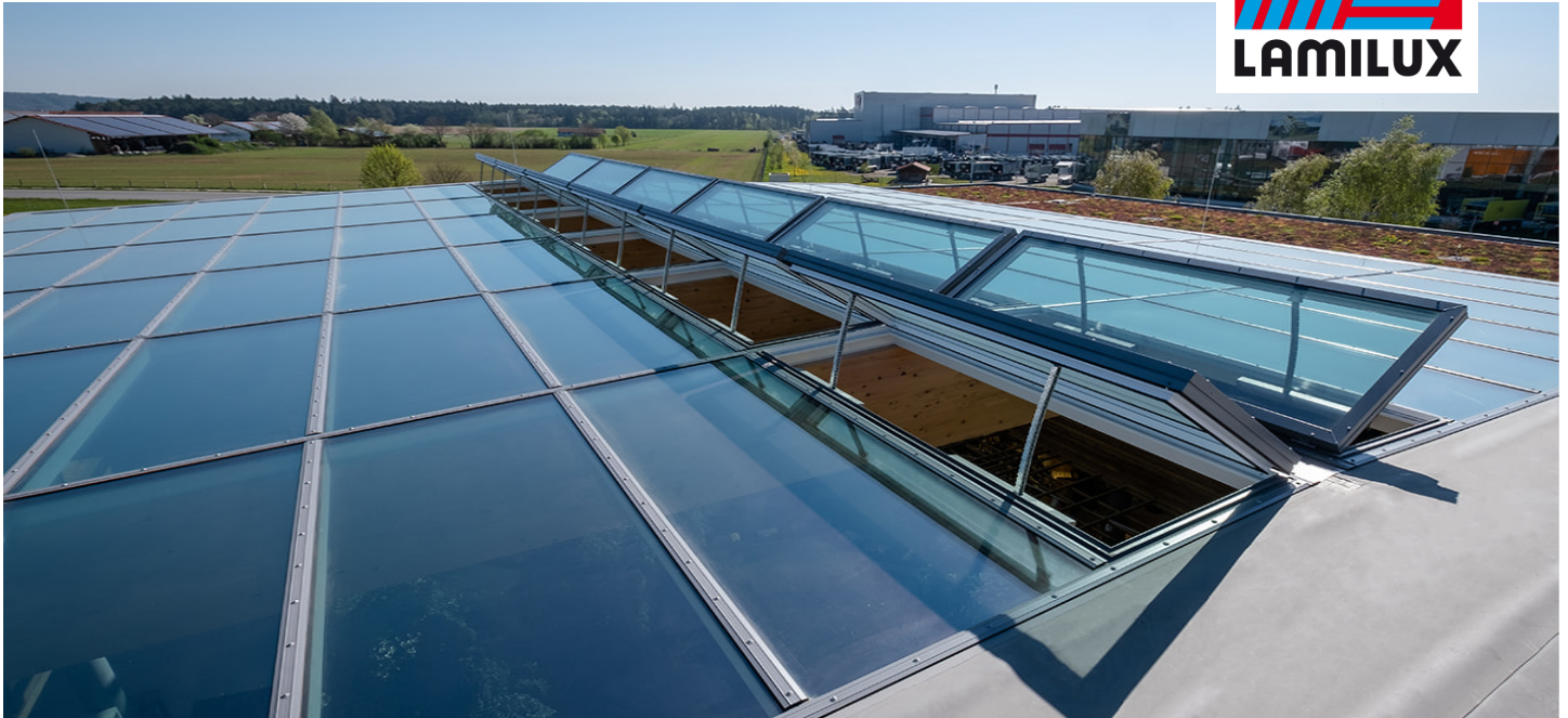
Byodo Naturkost GmbH, Mühldorf am Inn