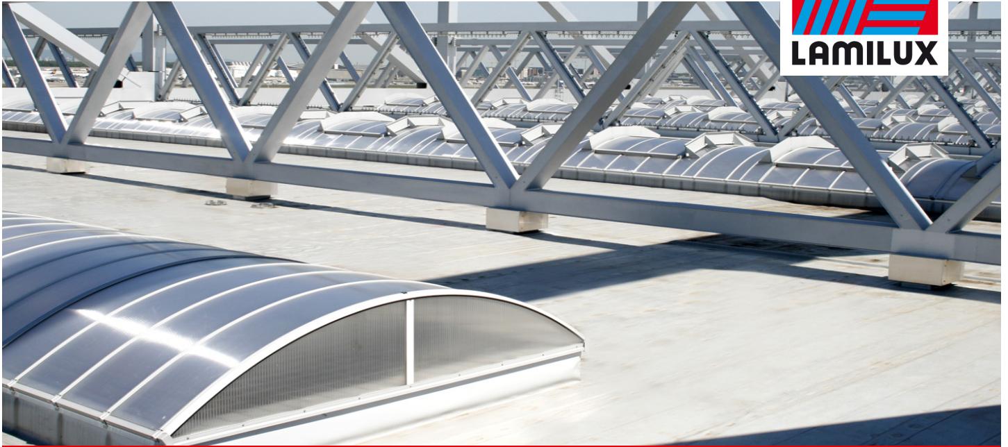
A380 Assembly Hangar