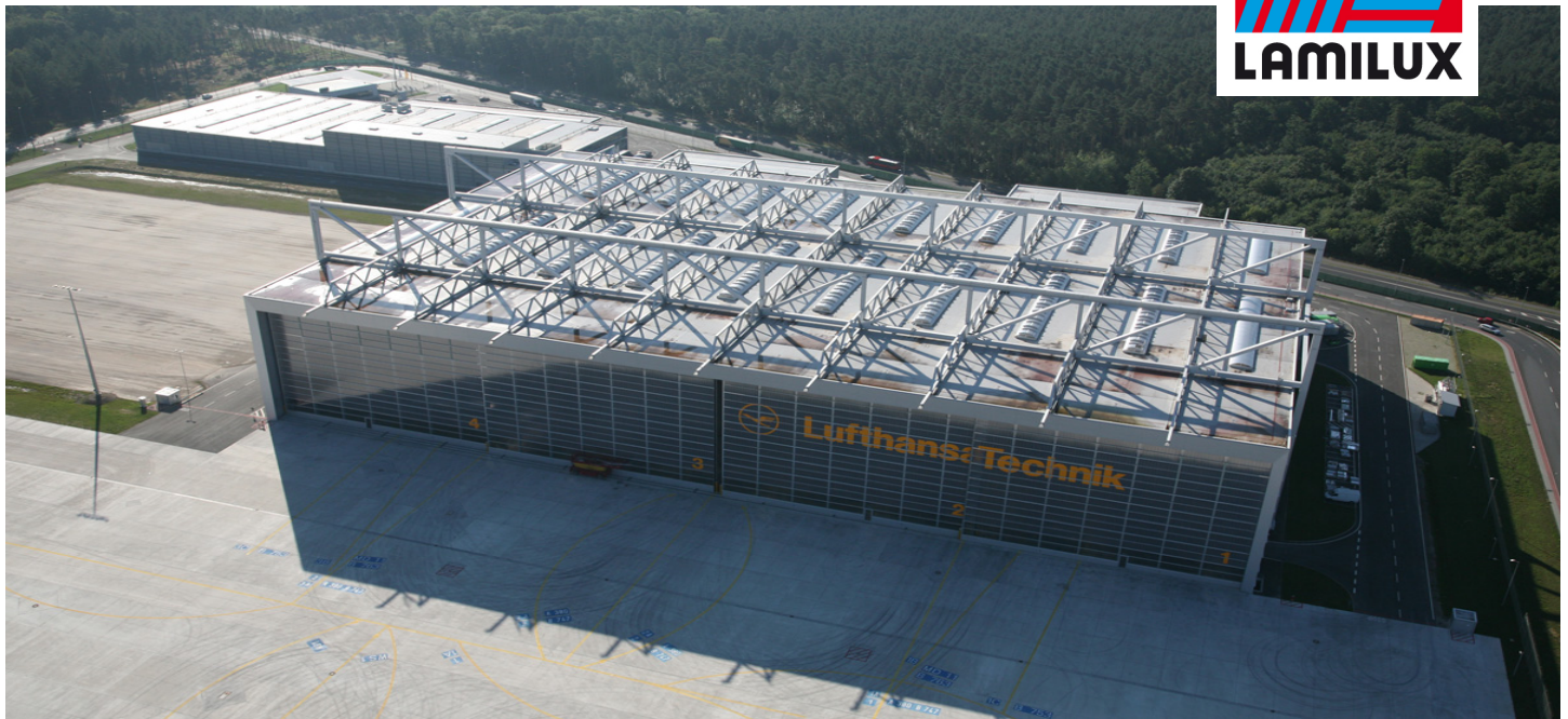
A380 Assembly Hangar