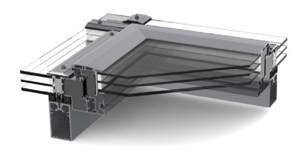
LAMILUX Ventilation Flap PR60 Variant 1

With circumferential cover strip for roof inclinations between 8^{\circ} and 75^{\circ}