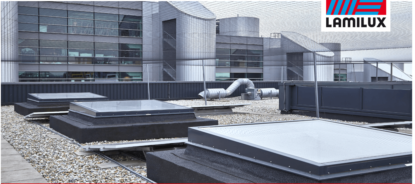
The Forum, Southend on Sea, England